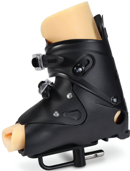
Universal Disposable Boot Liner