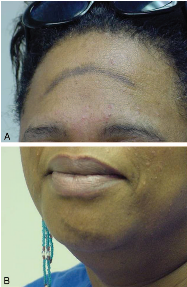
Figure 3. Forehead (A) and chin (B) pressure ulcers appearing at the resting sites of the face on the OSI positioner.